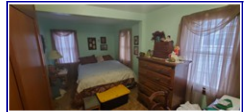
Main Floor Bedroom

Listing Price: $49,900 MLS #: 6130753 Finished Footage Above Grade: 818 Taxes with Assessments: $682.00 Assessment Balance: $401 Lot Square Footage: 7,100 Sf Siding: Vinyl(06') Roof: Asphalt(16') Condition: Good Basement: Full, Partially Finished Garage: 2-Car Detached, 26 x 24 Air Conditioning: None Heating/Cooling: Forced Air, Natural Gas Fireplace: None Laundry Area: Basement Electrical: Fuses