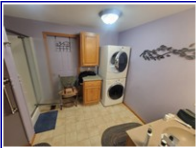
Main Floor Bath