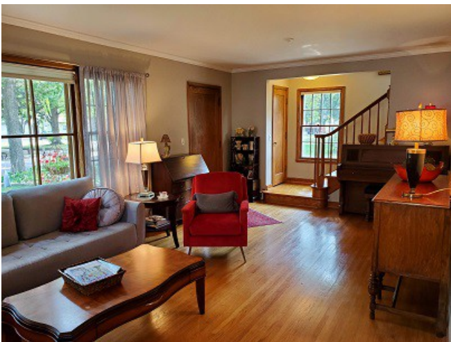
Living Room has gas fireplace