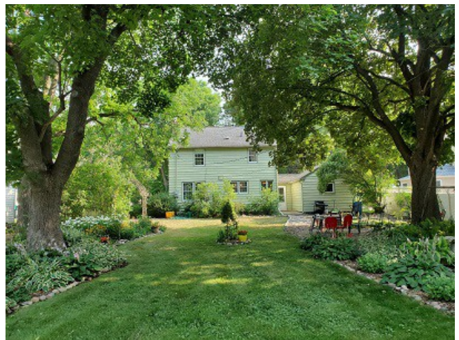
View of the back of the house