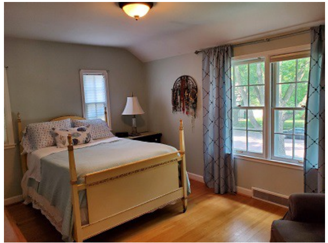
Upstairs bedroom with 2 closets