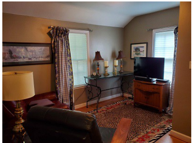
Bedroom 3 is used as a TV room