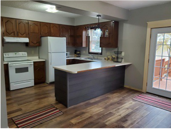
Kitchen & dining area