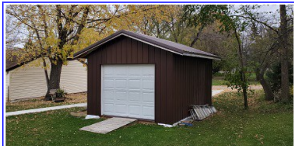
Back of the house

Listing Price: $78,000 MLS #: 6123761 Main Floor Living Area: 720 square feet Parcel #: 31-102013 - Sly 40' of Lot 13, Block 1, 1 st Railway Addition, City of Tracy, Lyon County, MN Taxes: $2,114.00 (H, 2021) Assessments: $65.00 (inc) Lot Size: 40' x 177' Age: 1920s Construction: Frame Siding: Metal siding Roof: Gable – Asphalt (2017) Condition: Normal Basement: Full under main level, unfinished Garage: None Windows: Casement & double hung Driveway: None Heating/Cooling: Natural forced air (2017), Central AC (unknown age) Laundry Area: Basement Deck/Patio/Fence: Back deck & ramp Ceiling Insulation: Unknown Wall Insulation: Unknown Floor Covering: Carpets, laminate & vinyl