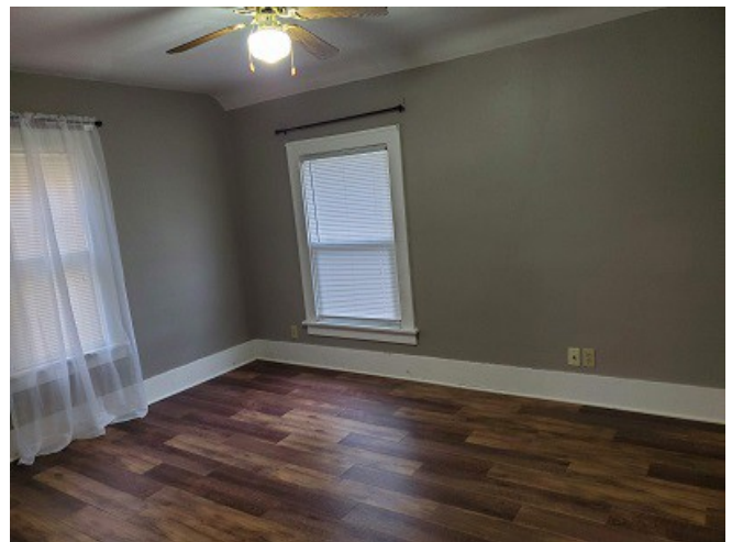
Upstairs bedroom 1