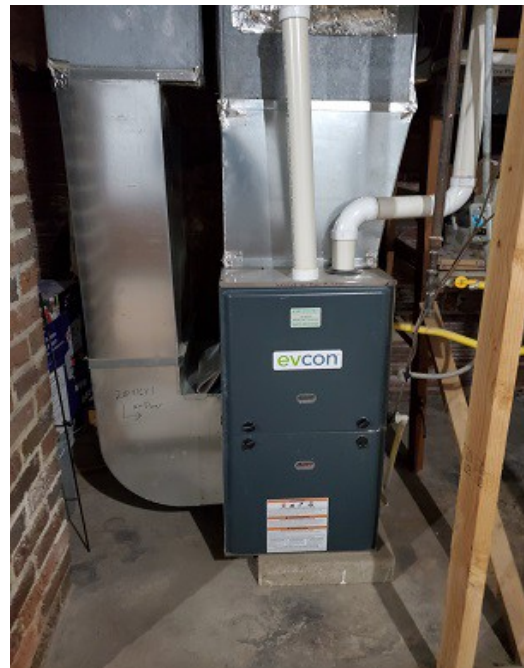
Updated furnace in basement