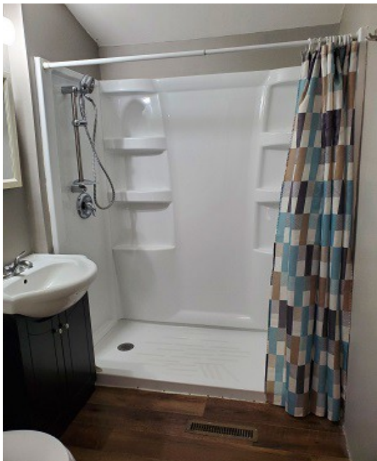
Renovated upstairs bathroom