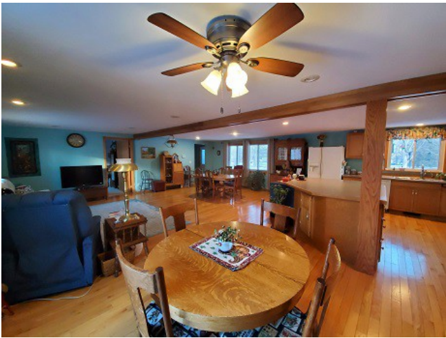
Dining room in to the kitchen & living room