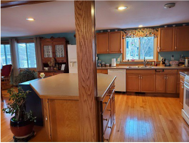
View of kitchen as you enter the house