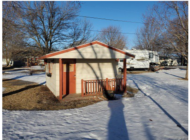
Backyard garden shed