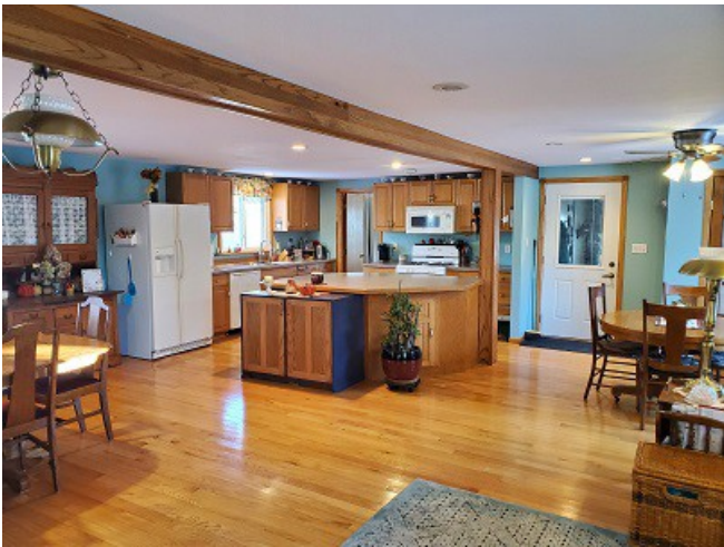
Living room in to the kitchen & dining room