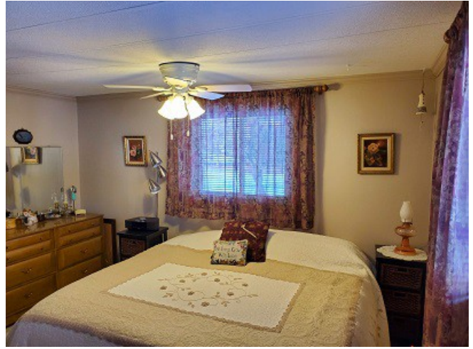
Bedroom 1, has walk in closet