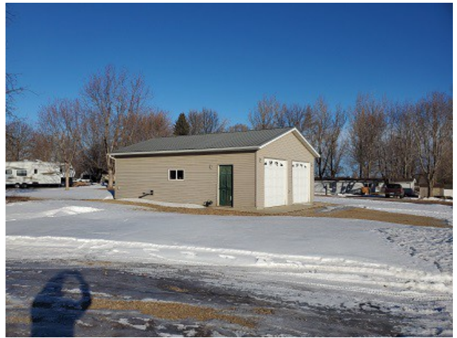
Detached two-car garage