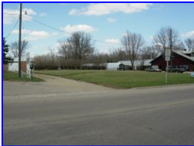
View of Property from US Highway 14

***There is natural gas serving the building, but no water or sewer lines