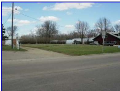
View of Property from US Highway 14

This image is a rendering of what the lot looks like. It is a rectangle 660' deep by 226' frontage with 130' x 137' cut out of the front (south) end of the lot. The south end of the lot touches US Highway 14.