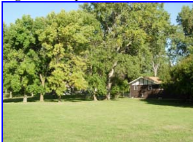
Over 3 acre yard area

Floor Covering: New carpets, hardwoods & vinyl